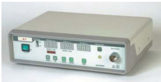
15ltr min electronic insufflator ADIN15